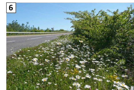
6. Proposed wildflower meadow to be introduced on the sides of the mounds. Undisturbed ground to be sown with a 100% native wildflower mix to enhance ecological value.