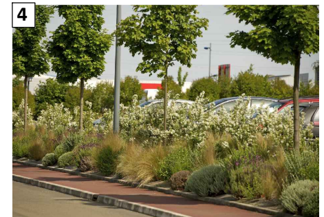
4. Proposed trees and shrub planting to car parking areas and service yards - Trees and shrub planting to provide structure to car parking areas and provide seasonal interest.