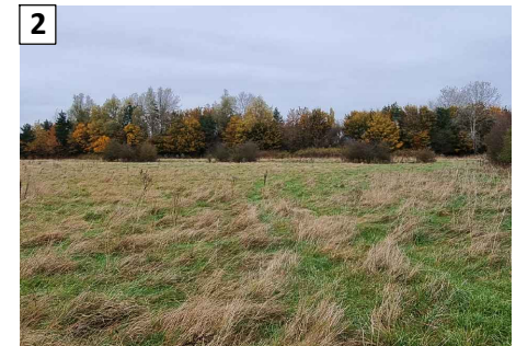
2. Existing woodland buffer to northern boundary - Existing buffer to provide screening of views from properties located to the north of the proposal site