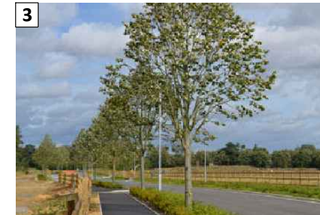
3. Proposed spine road trees - Large ornamental trees to provide structure to spine road and provide seasonal interest.