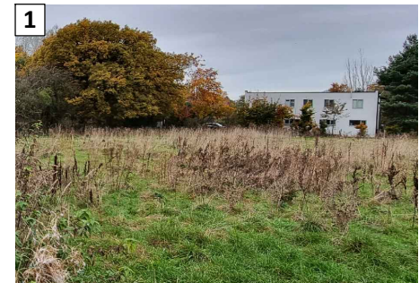
1. Existing property to western boundary - Views from property to be screened using large native standard trees and woodland mix planting