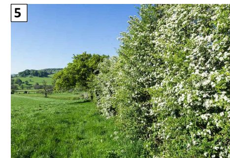
5. Proposed and retained native hedgerow - Hedgerow to enable movement of fauna and flora across site. Enhanced eco corridor route along retained ditch to the south west of the site created with proposed and existing hedgerow.